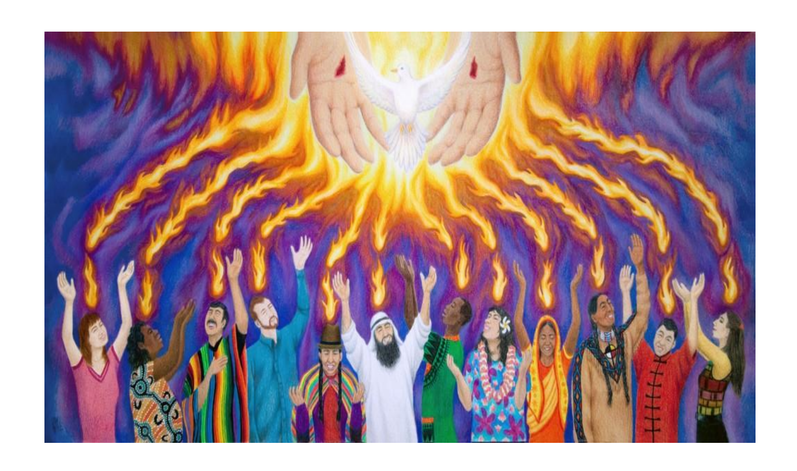
St. Alban's Episcopal Church May 31, 2020

Our Mission: We are called by the Spirit to be transformed by God in heart and mind, to serve our community, UCLA, and the world as the Body of Christ. We will grow in faith, hope and love through the practices of worship, formation, compassion and hospitality.