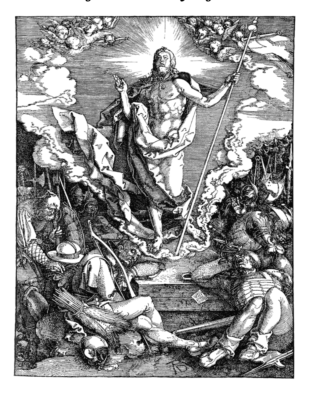
St. Alban's Episcopal Church May 10, 2020 Happy Mother's Day!

Our Mission: We are called by the Spirit to be transformed by God in heart and mind, to serve our community, UCLA, and the world as the Body of Christ. We will grow in faith, hope and love through the practices of worship, formation, compassion and hospitality.